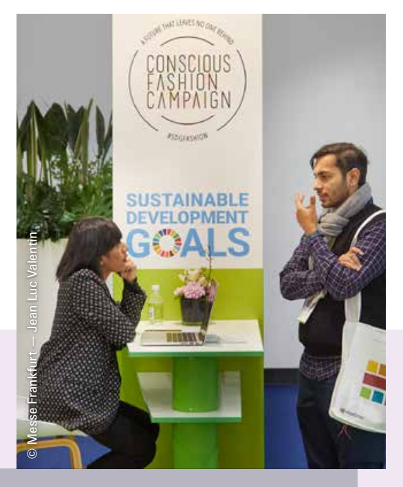
The Sustainable Development Goals are to be presented successively at the approximately 60 textile events in order to highlight the most urgent challenges facing the textile and fashion industry worldwide.

"Proyecto Seda" is a Latin American initiative aimed at promoting silkworm breeding (production and breeding of the Bombyx mori silk moth) through a sustainable approach and with local added value. At our Emitex textile trade fair, colleagues from our Messe Frankfurt Argentina subsidiary dedicated a special show space to the initiative, giving it an opportunity to present its work and the various stages of silkworm breeding, through to finished products, to a broad specialist audience. This artisanal activity can be carried out in family businesses and does not require specialised skills, large cultivation areas or special technology.