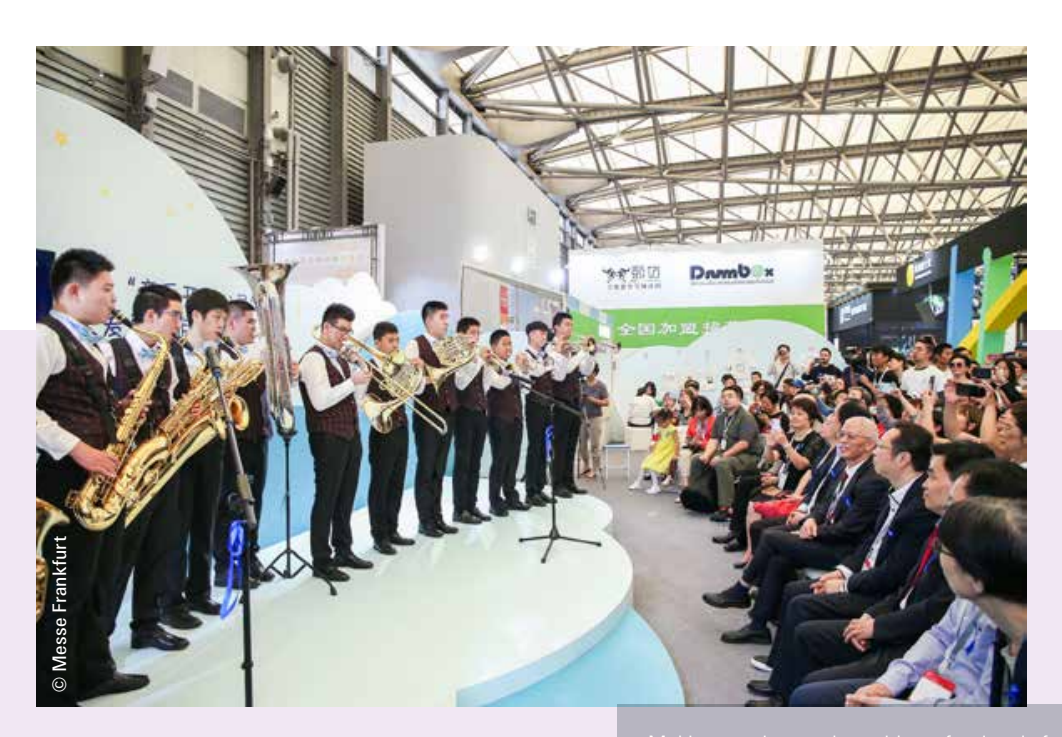
Making music together with professionals from the music industry and members of the autistic community as a way of raising public awareness and helping people with autism.

During Music China 2019 last October, our colleagues – as in the previous year – organised a project for the autistic community as a way of helping people with autism. Together with professionals from the music industry and members of the autistic community, they put on a series of inspiring instrumental and dance performances. 11 exhibiting companies donated musical instruments, while further donations amounting to around 50,000 RMB were collected at the dedicated "Love Coffee" shop in the exhibition grounds.