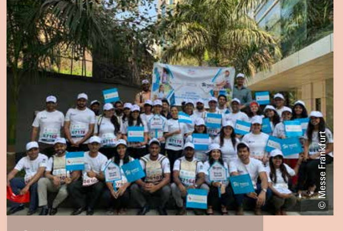
Our Indian colleagues support of the initiative of Habitat for Humanity India by taking part in the TATA Mumbai Marathon.

Within the scope of our partnership with Children for a Better World e.V., we suppor socially disadvantaged children and teenagers at a facility in the immediate vicinity of the exhibition grounds.