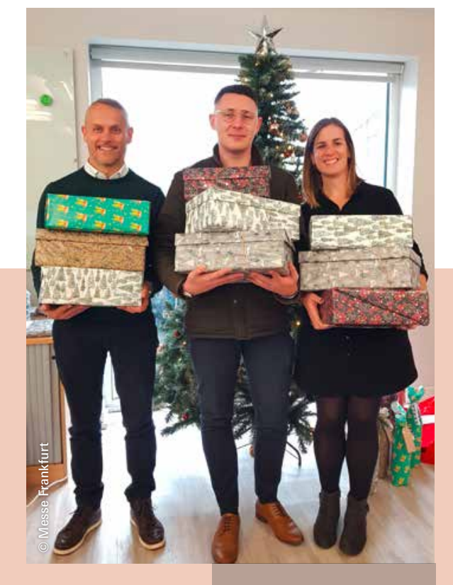
The gifts are packed and waiting to be distributed to retirement and care homes.