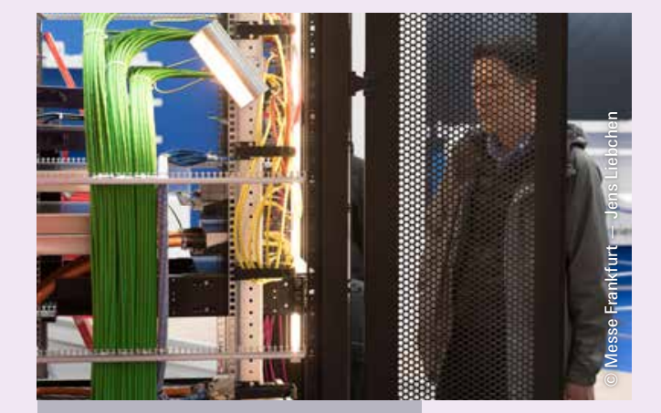
Constant innovation is an integral part of building technology.