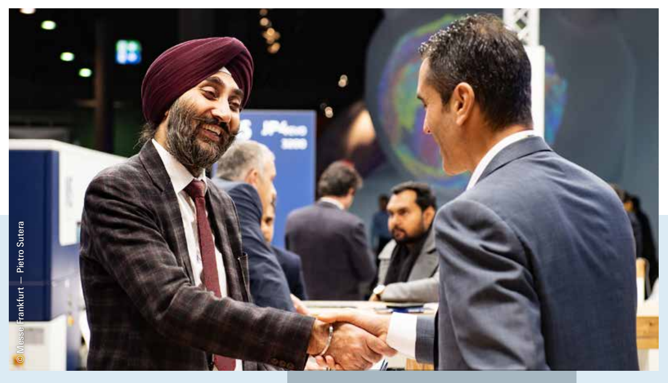
Promoting an international exchange of knowledge and expertise: Messe Frankfurt fosters long-term partnerships and cooperation.

Messe Frankfurt is committed to long-term and sustainable partnerships and cooperation, both with respect to its world-wide events and its CSR pledge. Intensive networking within the national and international business community as well as with central associations, specialist and development institutes benefits the quality of our events and therefore our customers. Not least, this also allows us to help shape the trade fair industry on a sustainable basis. We demonstrate our CSR commitment through our participation in the United Nations Global Compact, to which we signed up in 2010. We support the "fairpflichtet – right and fair" industry code for sustainable organisation and implementation of events and participate in the Charter of Diversity initiative.