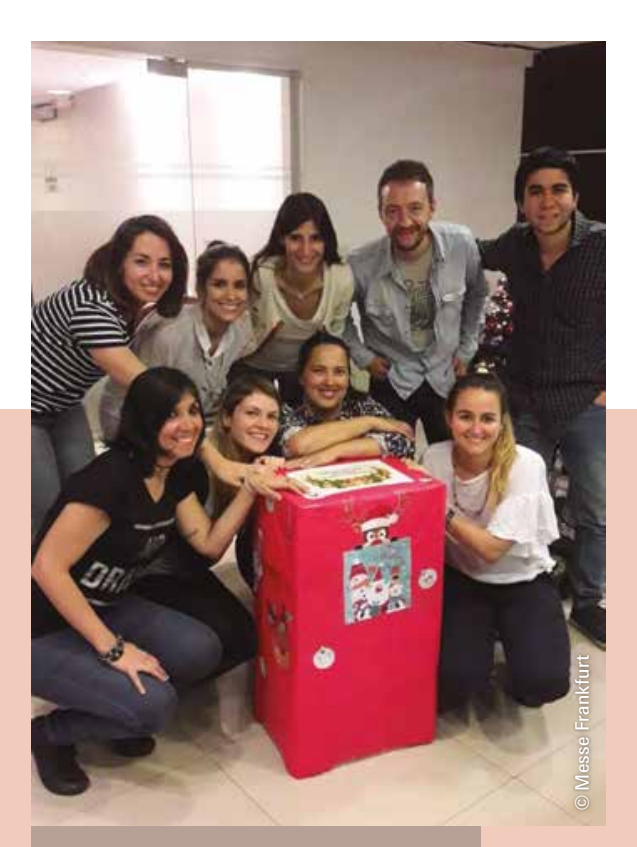
Help that reaches people: our Argentine colleagues help in many ways to improve the lives of disadvantaged people.

A school satchel that is crammed with everything children need and also gives a great deal of pleasure – thanks to the "Mochi" project. The initiative was launched in 2016 with the aim to provide children from low-income families with all the materials they need for their respective grade at the beginning of the school year. The satchels are passed on anonymously to the parents by the social workers of the districts. The children are not aware that they have been donated. Colleagues from Messe Frankfurt Argentina participated in this campaign for the first time.